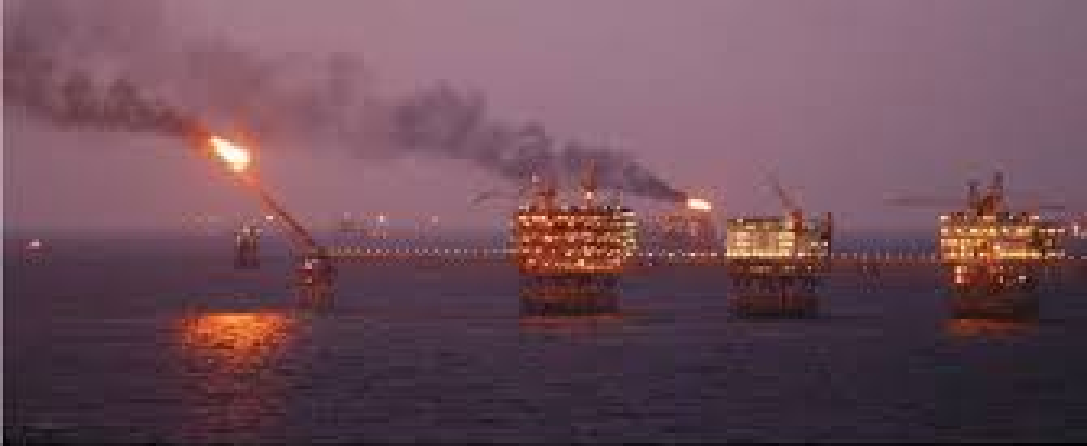
Some industrialized nations, seeking to reduce their dependence on imported oil, have required that a percentage of biofuel be blended with fossil fuels each year. Above, an oil refinery in Southeast Asia.